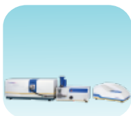
Laser Particle Size Analyzer