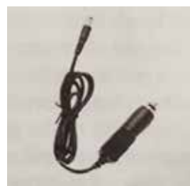
Vehicle Power Cord