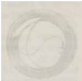
Nasal Breathing Tube